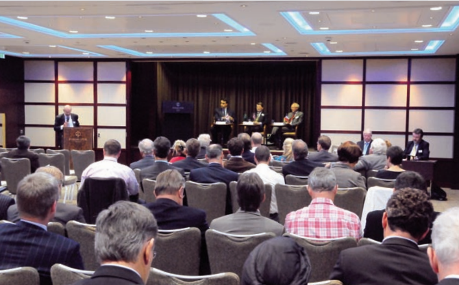
The JCRA's October 2009 seminar marking the four-year anniversary of the implementation of the Competition Law.

In 2009, we had five main aims. The first three of these concerned the administration and enforcement of, respectively, the Competition (Jersey) Law 2005, the Telecommunications (Jersey) Law 2002 and the Postal Services (Jersey) Law 2004. The last two relate to advising on competition and regulatory matters and implementing our core values.